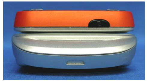
Sony W550i Top