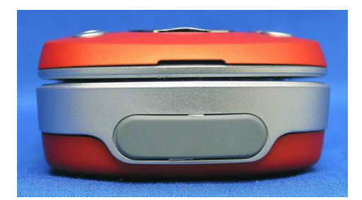
Sony W550i Bottom