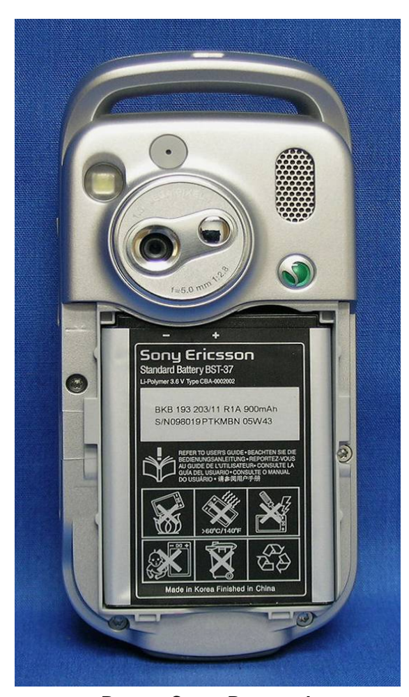
Battery Cover Removed