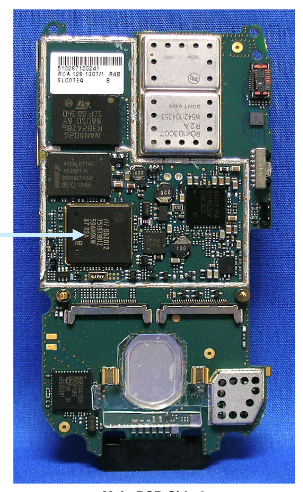
Main PCB Side 2

PowerPC 750CXe DB2012 RISC microprocessor