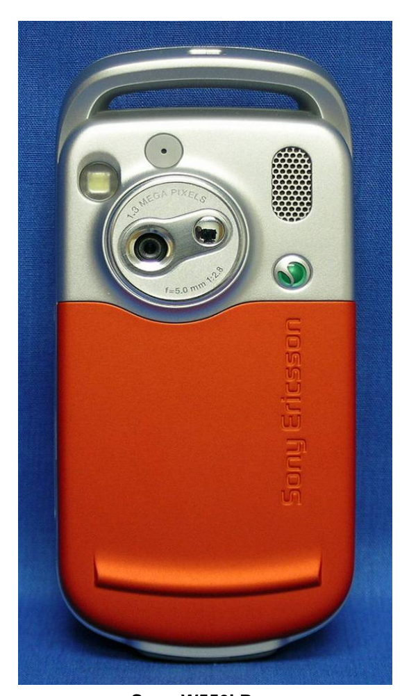
Sony W550i Rear