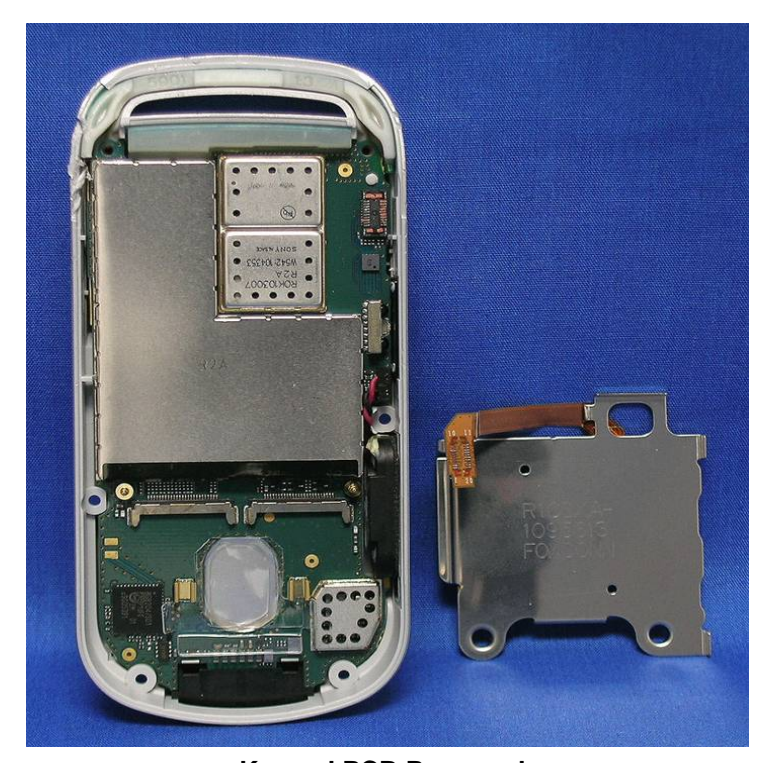
Keypad PCB Removed