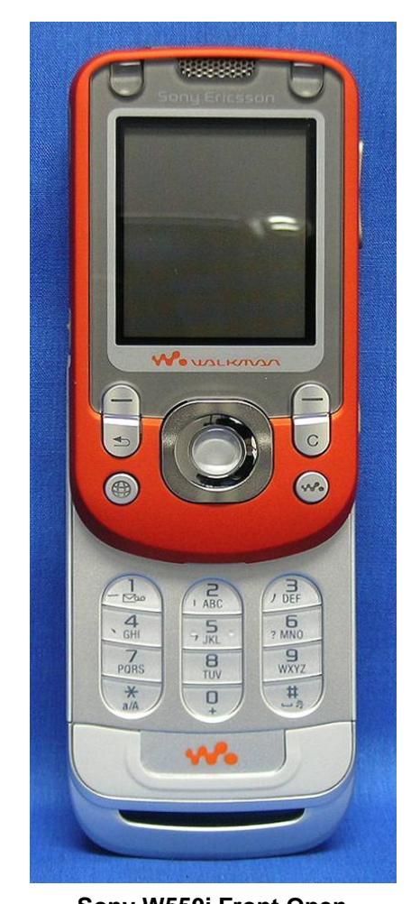
Sony W550i Front Open