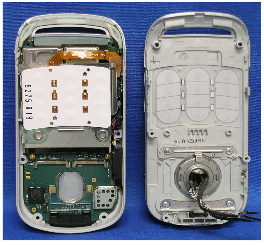
Rear Half Front Cover Removed