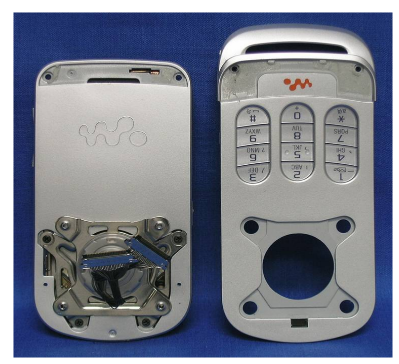
Rear Half Front Cover Removed