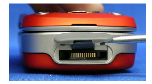
Connector Cover Open