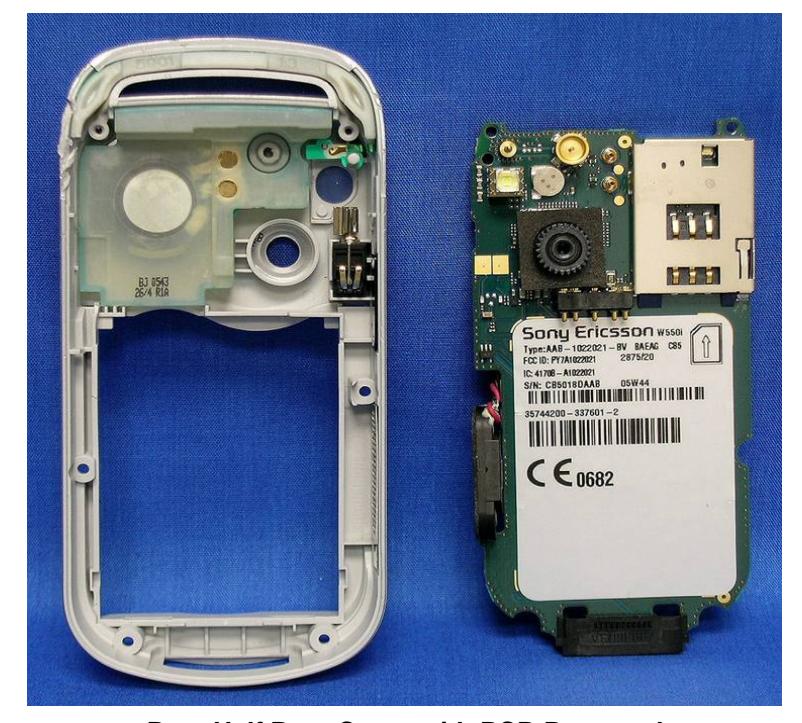
Rear Half Rear Cover with PCB Removed