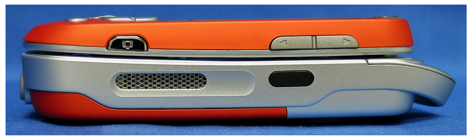
Sony W550i Right