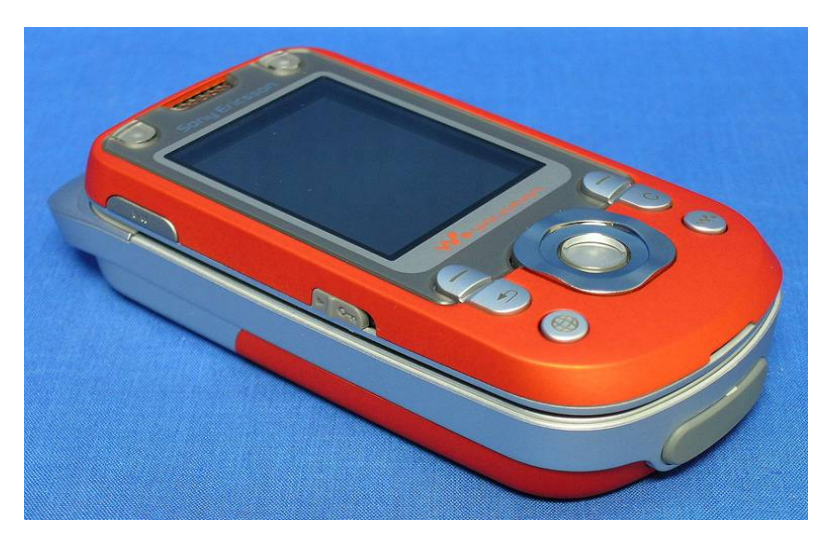
Sony W550i Front Angle