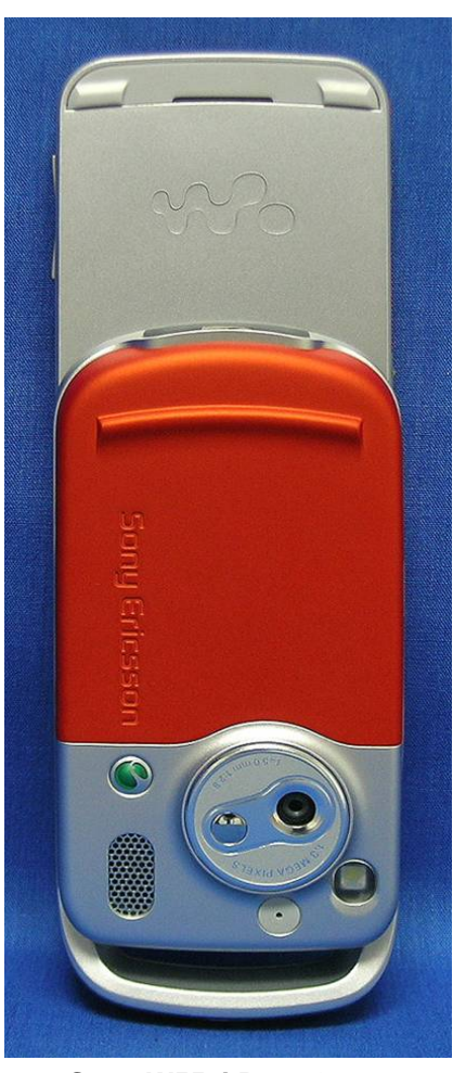
Sony W550i Rear Open