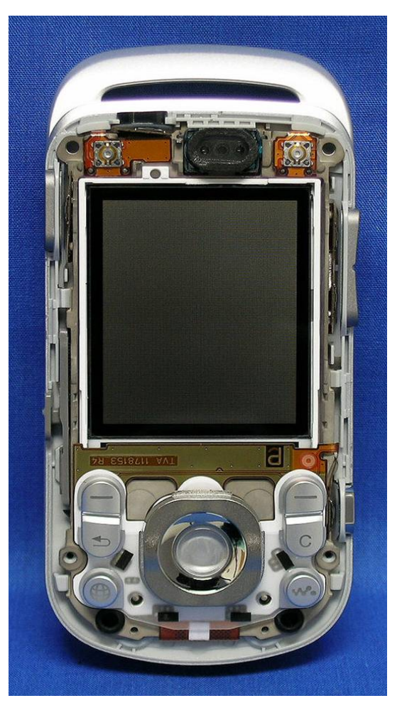
Front Cover Removed