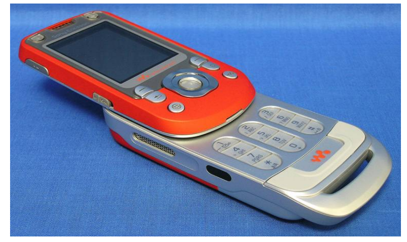
Sony W550i Front Angle Open