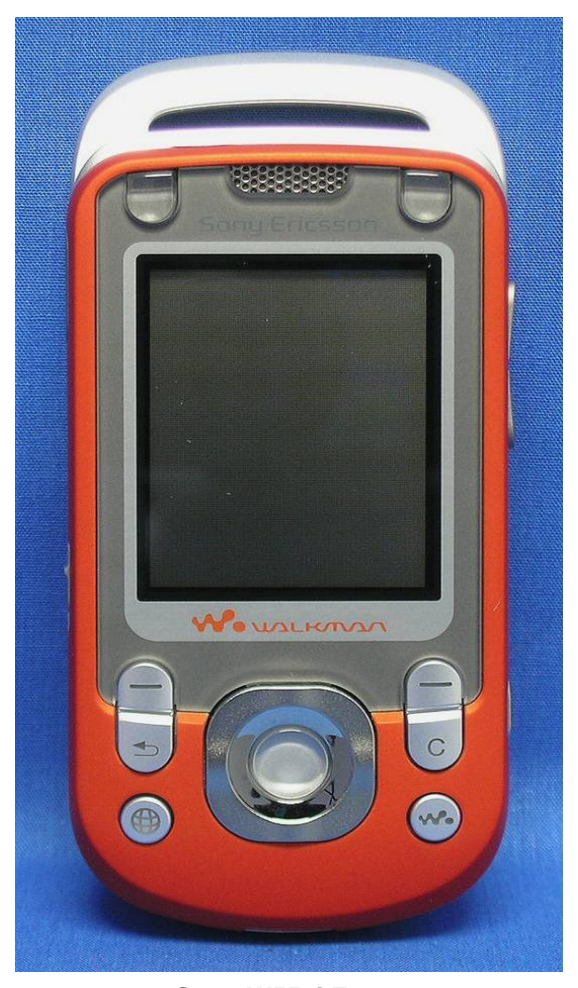
Sony W550i Front