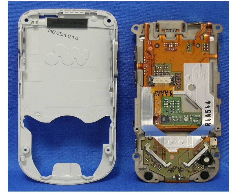
LCD Assembly Removed