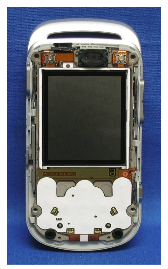
Front Keypad Removed