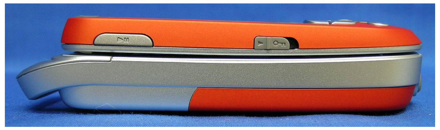
Sony W550i Left